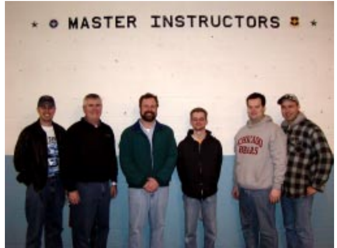
A few of the CCSCC master instructors

of the students returned to a slightly revised course for open-run test and tune. In the end, smiles were permanent and skills were improved. As in any autocross, the only casualty were cones and tire life (the cones definitely got a workout). Thanks to all the students and club members who made this event such a success. I’ll do my part to see the club keeps up this tradition.