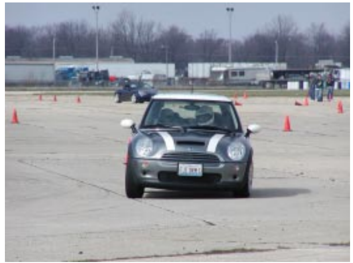
CCSCC AutoX school physics laboratory...